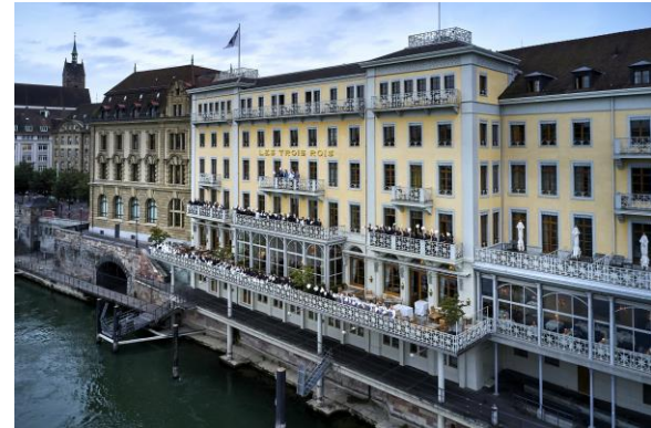
Grand Hotel Les Trois Rois