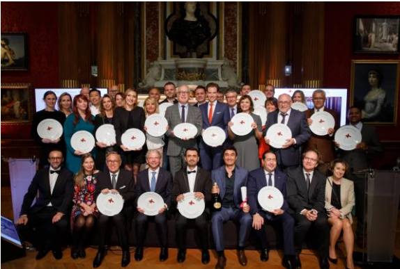
All the 2019 Prix Villégiature award winners