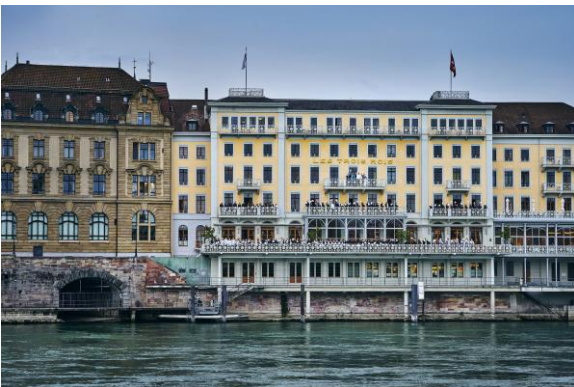
Grand Hotel Les Trois Rois